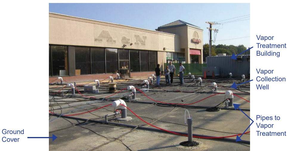
ERH system cleans up contaminated soil and groundwater.

In situ thermal treatment methods speed the cleanup of many types of chemicals and are among the few in situ methods that can clean up chemicals that don't dissolve readily in groundwater. Thermal treatment can be used in silty or clayey soil where other cleanup methods do not perform well. It also can reach contamination deep underground or beneath buildings, which would otherwise be difficult or costly to dig up to treat above ground. In situ thermal treatment has been selected for use at dozens of Superfund sites and other cleanup sites across the country.